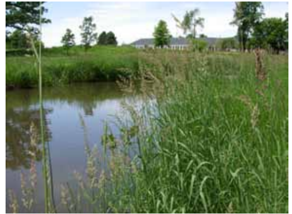
Reed canary grass infestation along Flint Creek in Lake Barrington.