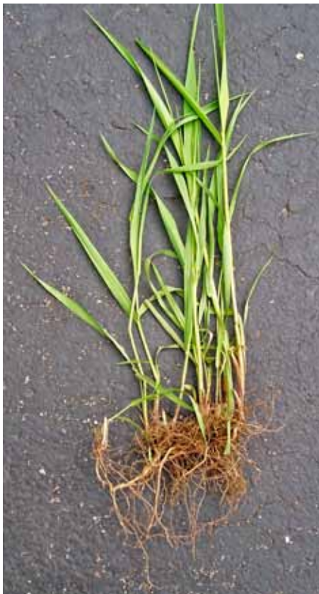
Broad leaves and rhizome structure of reed canary grass.

The plant produces leaves and flower stalks for 5 to 7 weeks after germination in early spring, then spreads laterally. Growth peaks in mid-June and declines in mid-August. A second growth spurt occurs in the fall. The shoots collapse in mid to late summer, forming a dense, impenetrable mat of stems and leaves. The seeds ripen in late June and shatter when ripe. Seeds may be dispersed from one wetland to another by waterways, animals, humans, or machines.