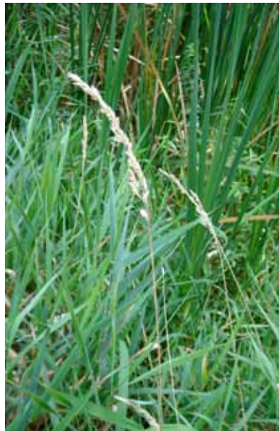
Late-season seed head: tan, closed.

Reed canary grass is found in dense stands along roadsides, in wetlands, ditches, stream and pond banks, moist fields, and wet meadows. It can grow on dry upland soil and in wooded areas, but it grows best on fertile, moist, organic soils in full sun, especially in disturbed wetlands.