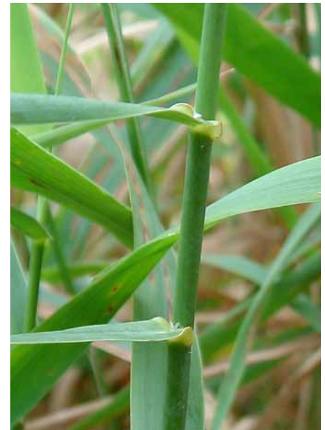
Large, thin, membranous ligules protrude from the nodes where the leaves are attached to the stem.